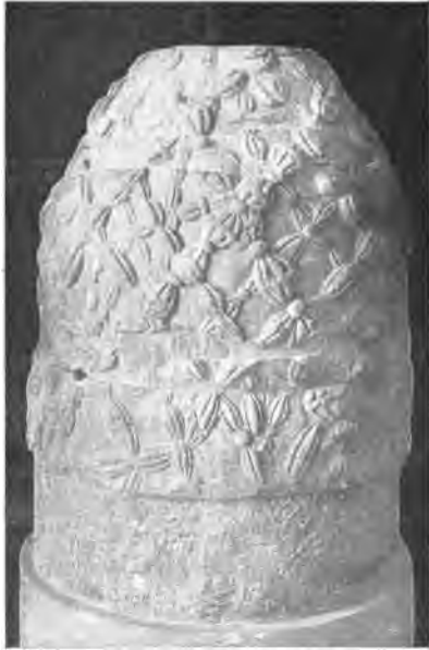
Fig. 1. Omphalus, copy of a stone bound with fillets that was set up at Delphi to mark the center of the earth.

habited by strange people and monsters, the tiny race of Pygmies, one-eyed giants, and serpents. Far in the North lived a good and happy people, the Hyperbo'reans, and to the South "the